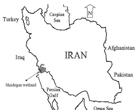
Figure 1. Map of Iran and location of study area, Shadegan.

role in the natural functioning of the northern Gulf. They support an extremely diverse wetland fauna and flora, and thus play an important role in maintaining the genetic and ecological diversity of the region (Scott 1995). Several studies have pinpointed major sources of contamination in this area, including agricultural use of fertilizers, herbicides and pesticides, and also hazardous substance spills from various refineries and Bandar Imam Khomeini Petrochemical Factory (Zolfaghari et al. 2007).